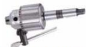
Twist Drill Chuck

Complete setup to adapt your Holemaker Machine to use twist drill bits.