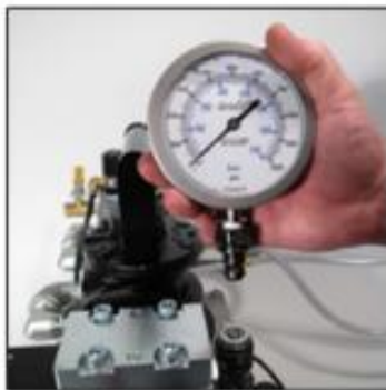
Removable Pressure Gauge