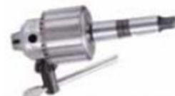
Twist Drill Chuck

Complete setup to adapt your Holemaker Machine to use twist drill bits.